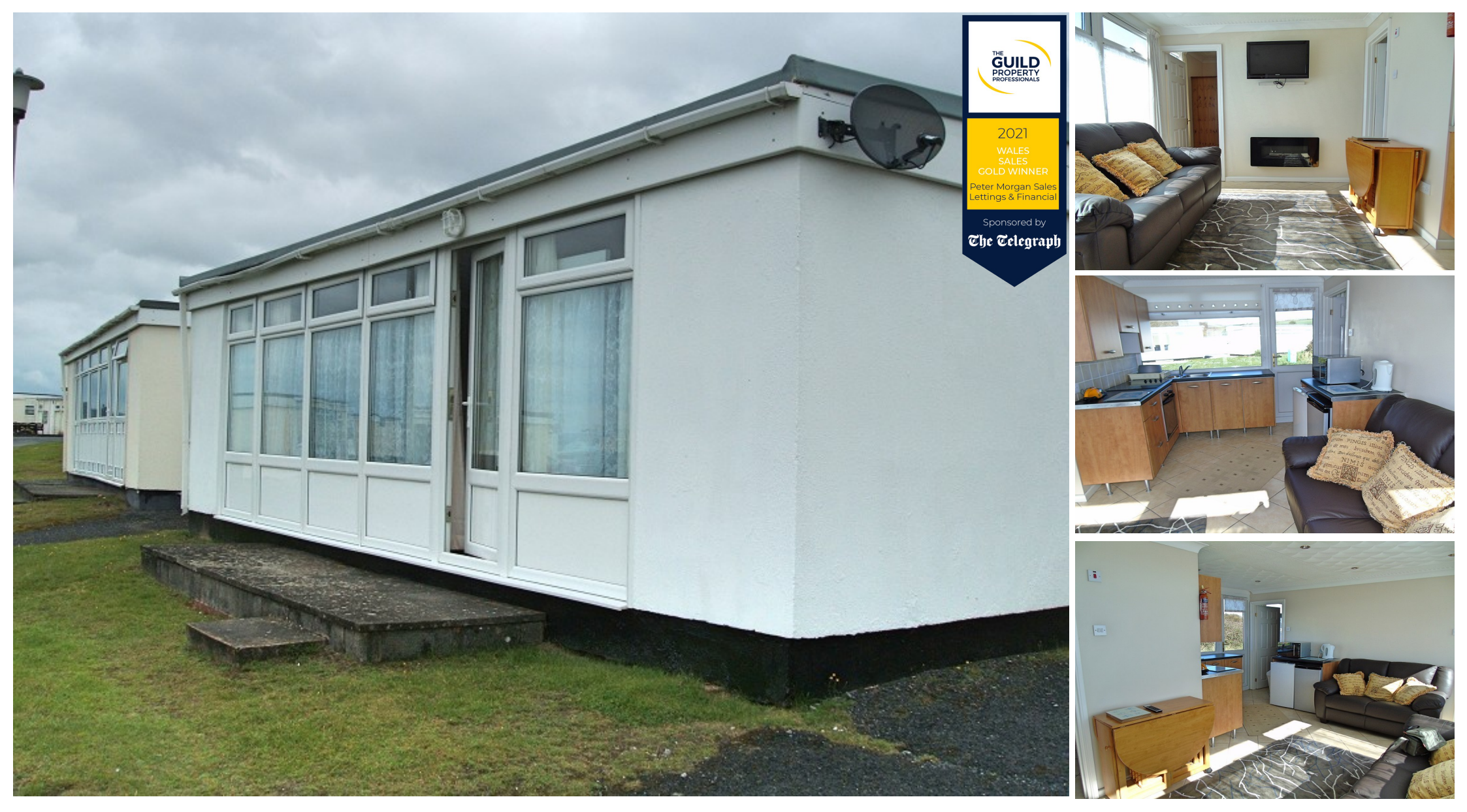
Chal 26 Carmarthen Bay Holiday Park, , Kidwelly, Carmarthenshire. SA17 5HQ