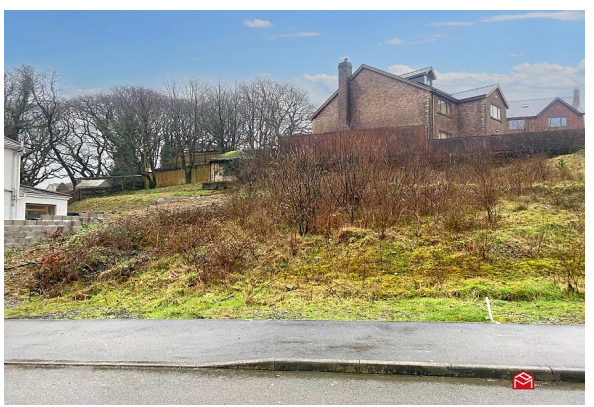
Plot 26a Varteg Row, Bryn, Port Talbot, Neath Port Talbot. SA13 2RF