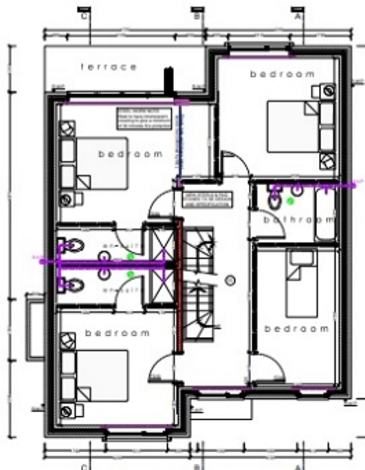
Proposed GA First Floor Plan 1:50