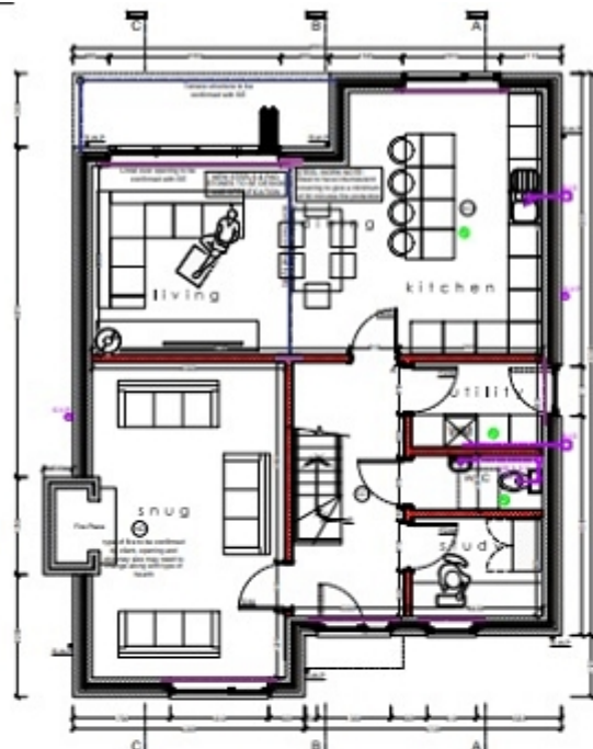
Proposed GA Ground Floor Plan 1:50